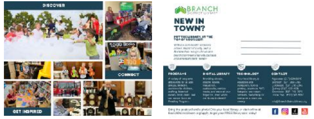
Customized postcard send to new residents in Branch County!

The "New Mover" service approved last year is up and running. We are working with a vendor by the name of Unique. They will send our customized postcard highlighting our amazing library system. Unique identifies the new residents and automatically sends the postcard every quarter. The postcard is addressed specifically to an individual. The postcard can be used for address verification for applying for a library card.